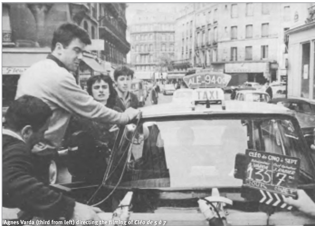
Agnes Varda (third from left) directing the filming of Cléo de 5 à 7

11 JUNE – 13 JULY 2018 9 AM – 4 PM, MONDAY – FRIDAY UNIVERSITY OF HOUSTON